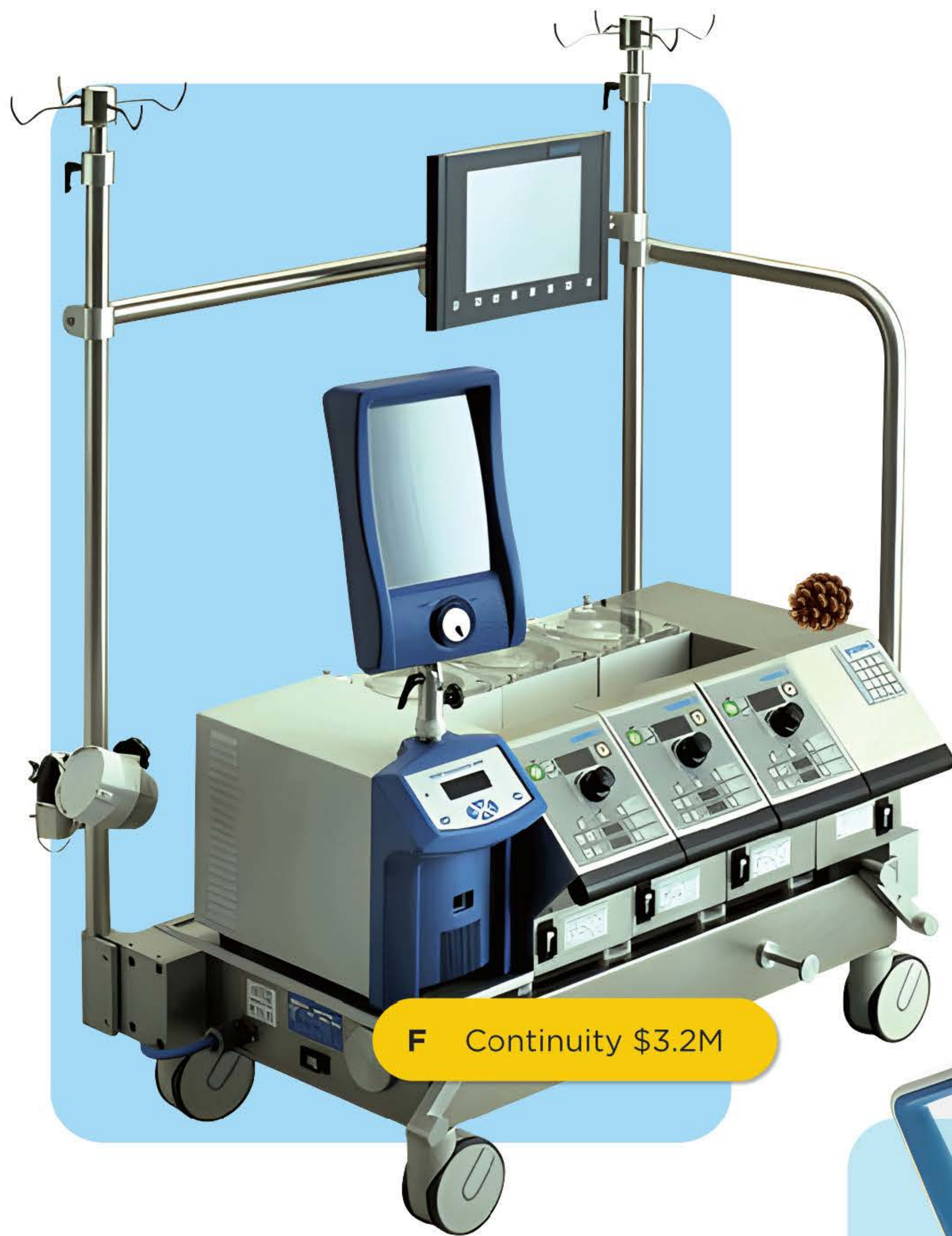
F Continuity $3.2M