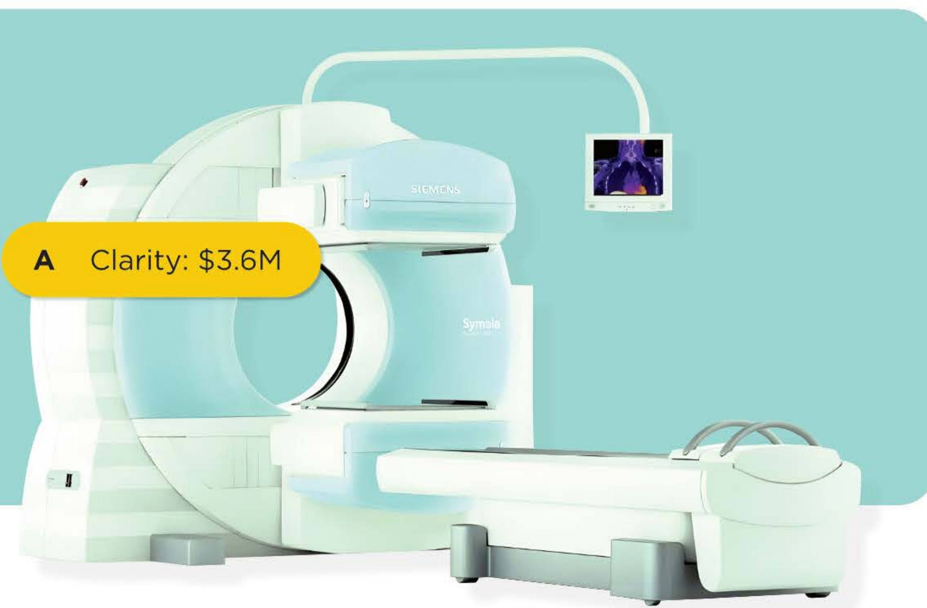
A Clarity: $3.6M