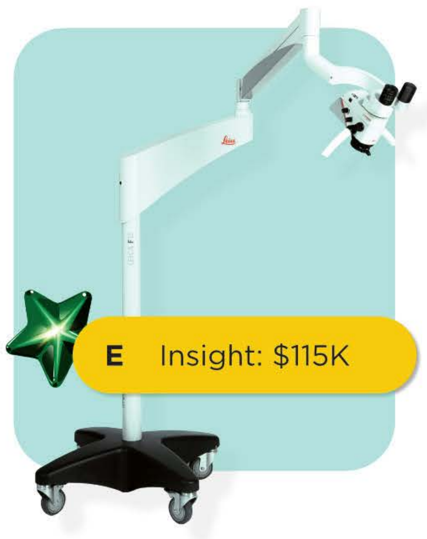
E Insight: $115K

*This catalogue represents a fundraising campaign for the collective purchase of all items listed to benefit St. Mary's General Hospital. Donations through this campaign will go toward a general priority fund to purchase the equipment listed.