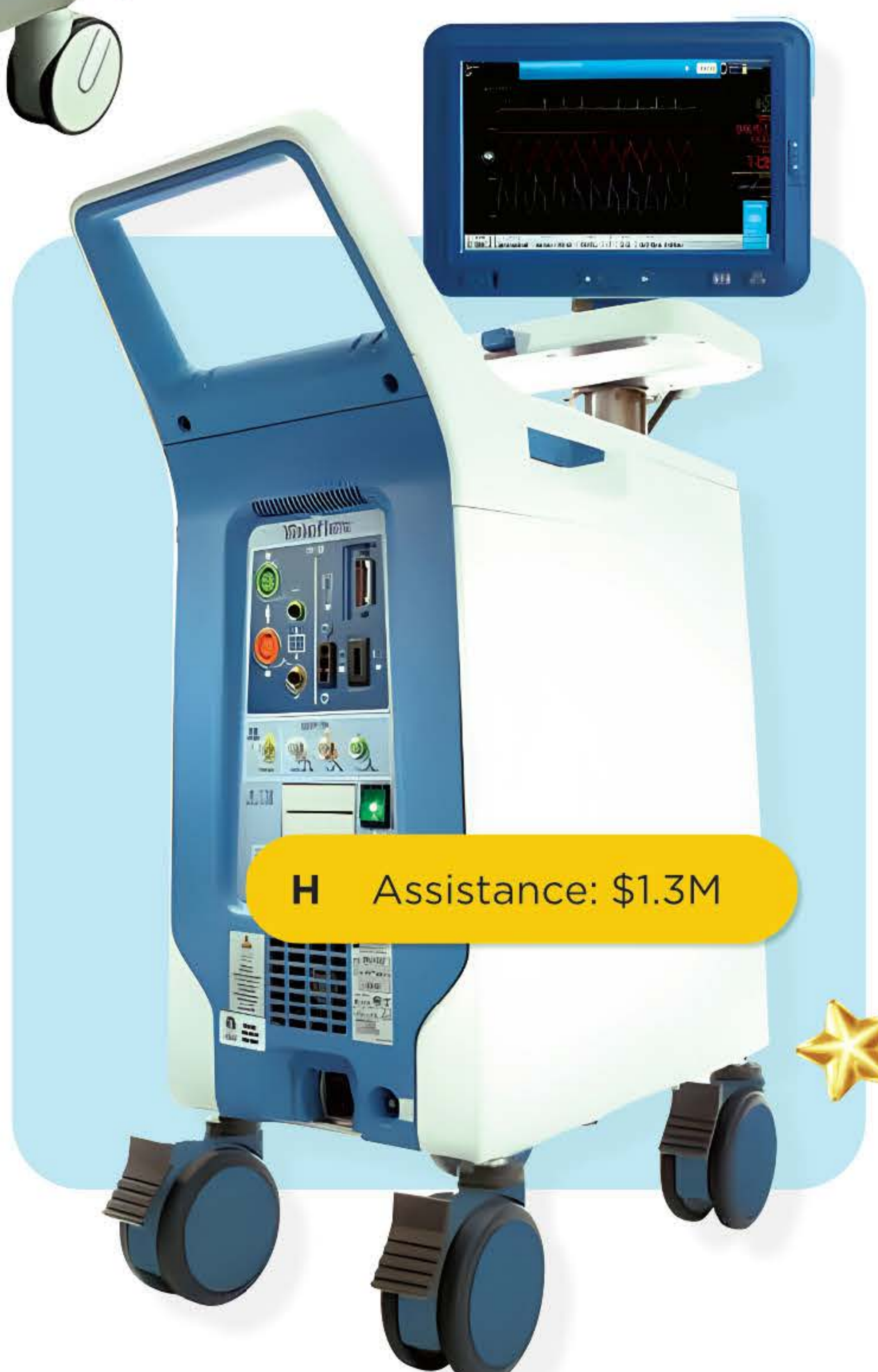
H Assistance: $1.3M