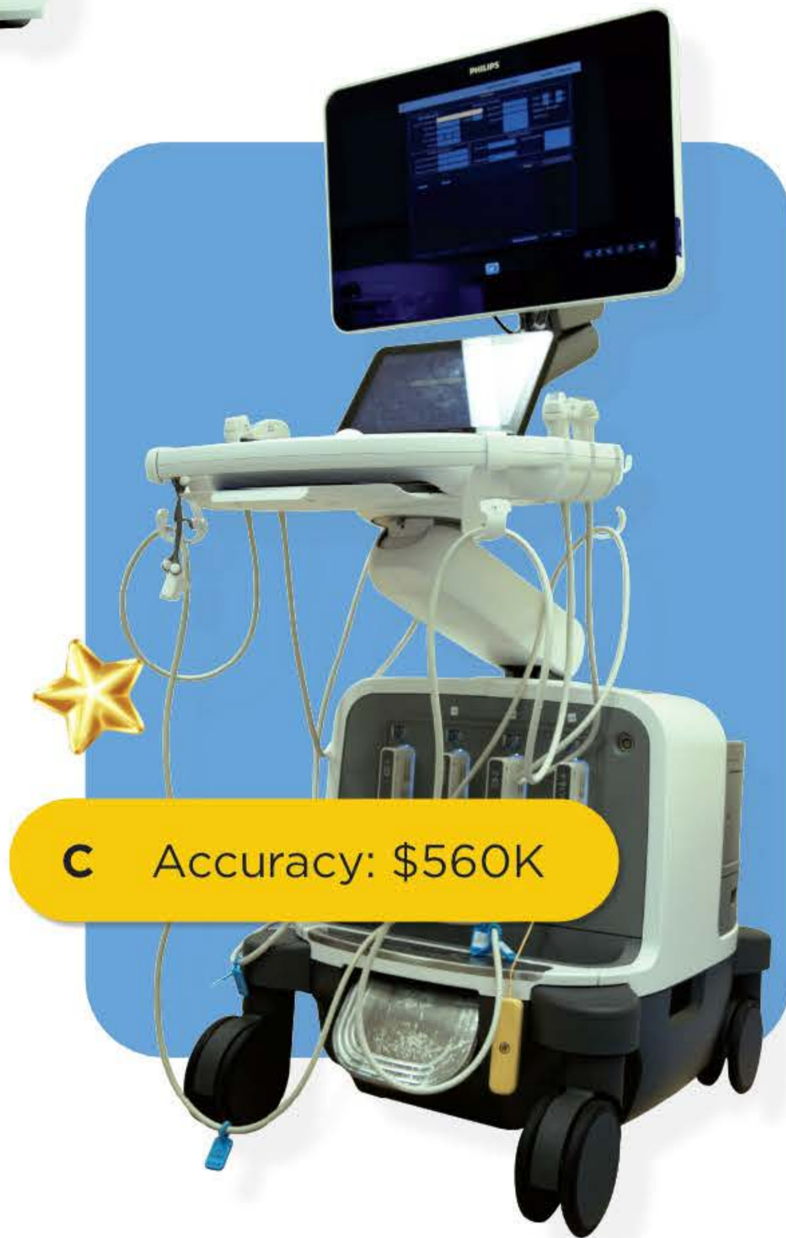
C Accuracy: $560K