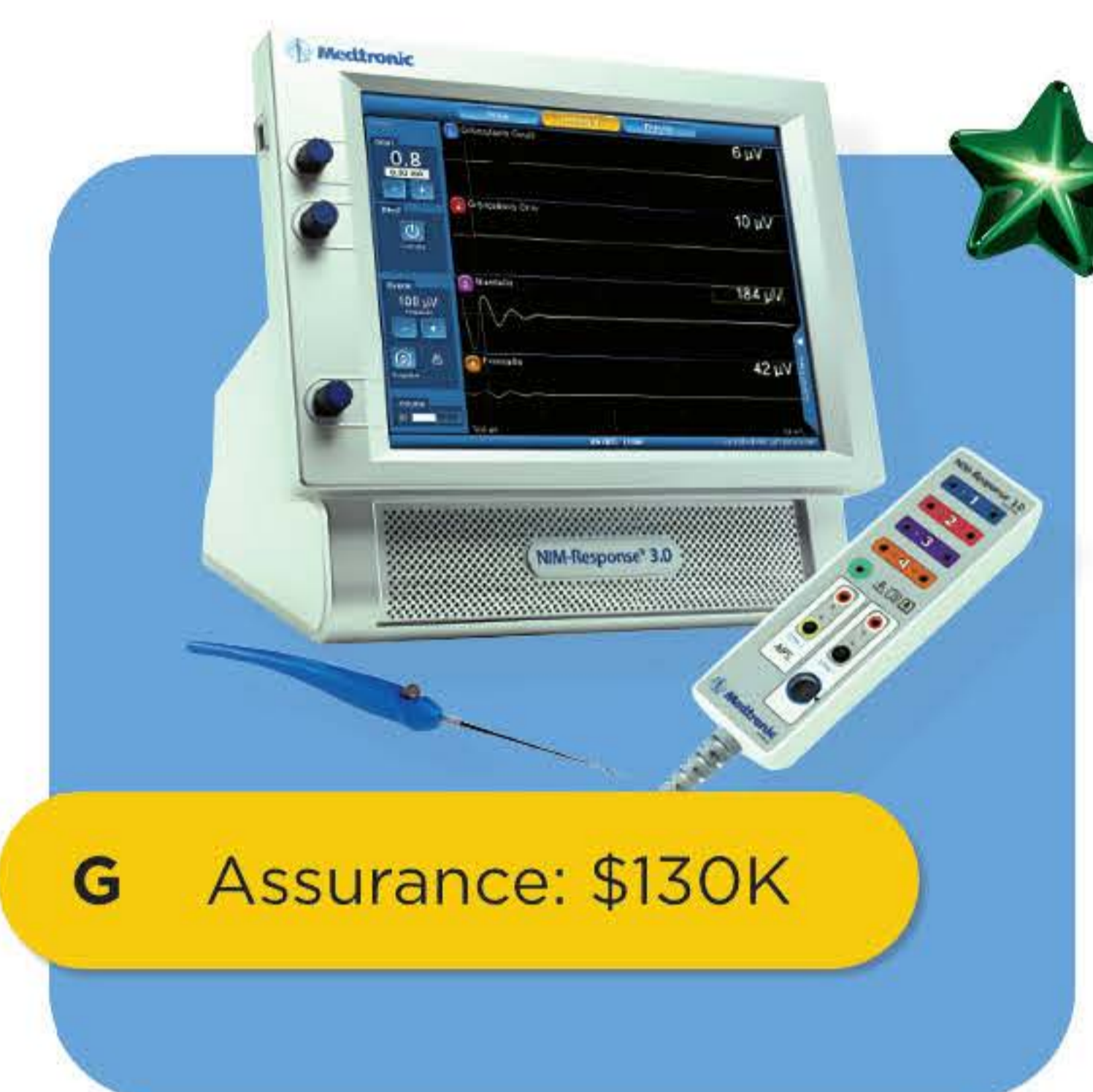
G Assurance: $130K